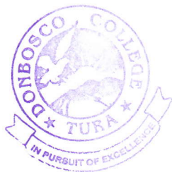
PRINCIPAL DON BOSCO COLLEGE TURA-794 002